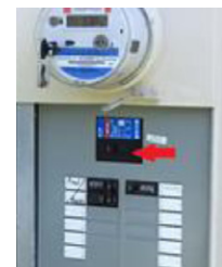
EXTENDED SERVICE OUTSIDE